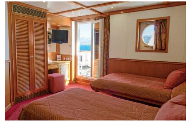
Cabin on the Upper Deck of the M/V Athena