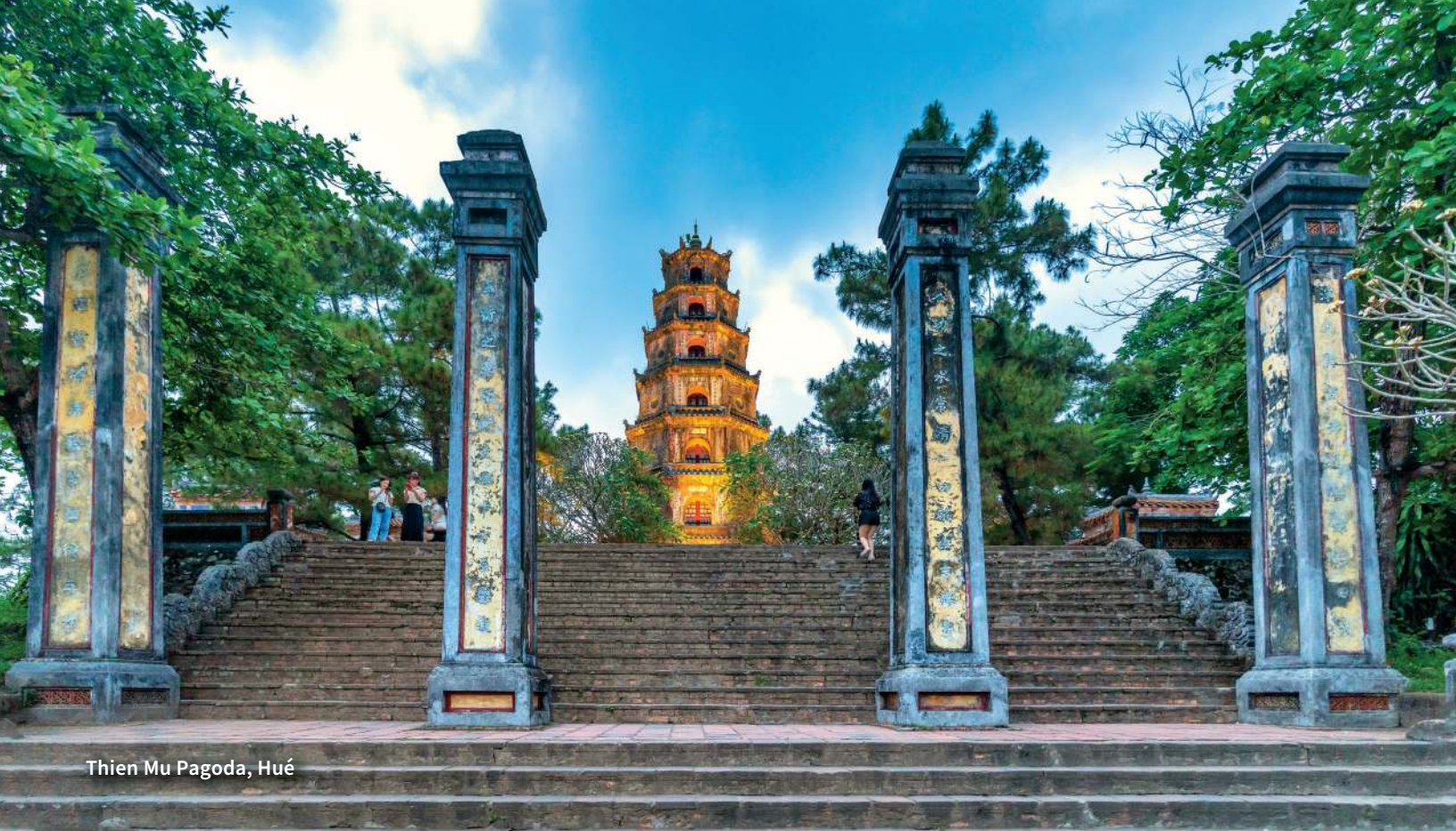
Thien Mu Pagoda, Huế