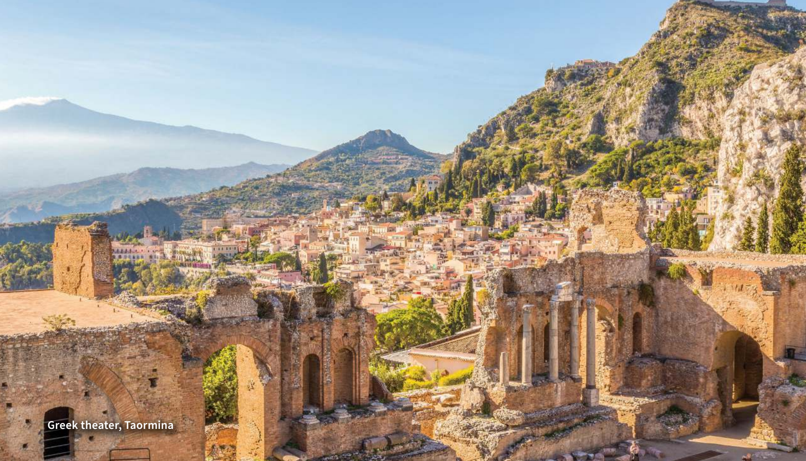
Greek theater, Taormina